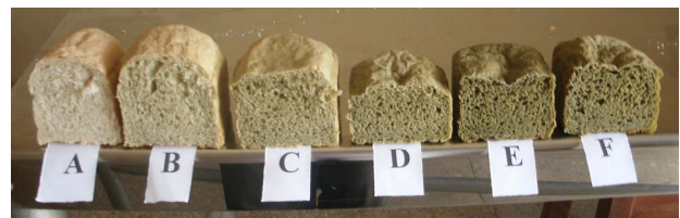
Plate 1. Crust appearance of bread supplemented with Moringa leaf powder.

A = 100% WF; B = 99% WF:1% MLP; C = 98% WF:2% MLP; D = 97% WF:3% MLP; E = 96% WF:4% MLP; F = 95% WF:5% MLP; WF = Wheat Flour; MLP = Moringa Leaf Powder.